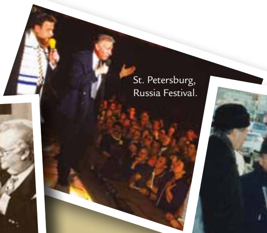
St. Petersburg, Russia Festival.