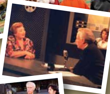
It's Supernatural! TV show begins airing.