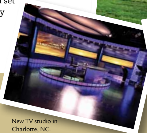
New TV studio in Charlotte, NC.