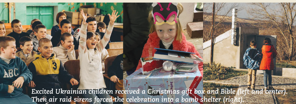
Excited Ukrainian children received a Christmas gift box and Bible (left and center). Then air raid sirens forced the celebration into a bomb shelter (right).

May you stand in awe of God and THRIVE in 2025! ✨