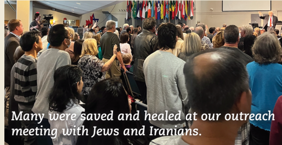
Many were saved and healed at our outreach meeting with Jews and Iranians.

This year begins the MAIN EVENT! We will experience greater Glory than Pentecost, Azusa Street, the Jesus Movement and the Charismatic